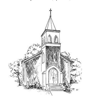
St. Stanislaus, Chatsworth Sunday 9:00 am